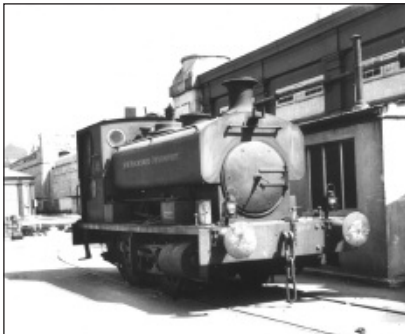
The Royal Naval Dockyard at Devonport has had its own internal railway system since 1867, and a selection of locomotives has operated over it and continues to do so on the much truncated layout.