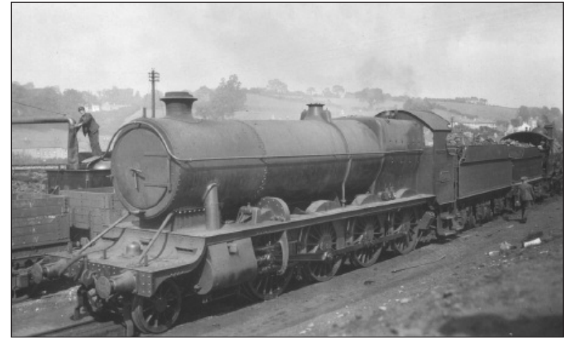
Awaiting coaling at Laira shed in September 1928 is 4701 with a Duke class 4-4-0 behind it.