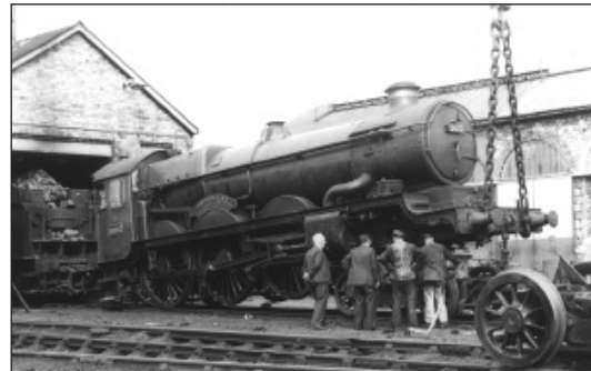
The weighing shed at Newton Abbot works was situated between the main works building and the station.