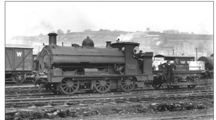
A member of the class with a 'Half-cab' and saddle tank, 1932, stands in Laira yard as the crew and the shunter pose in the 1920s.